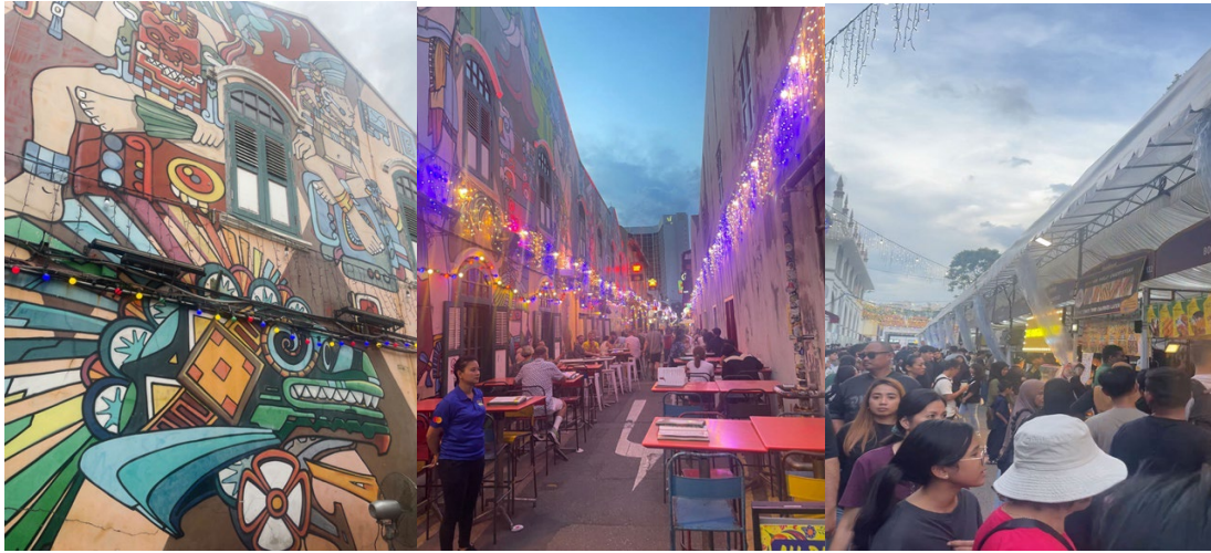
*Image of the Muslim market

University during the spring semester of 2023, for enriching my time in Singapore.