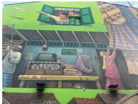
*image: the wall near the Muslims market

Because Singapore is a melting pot of cultures, including Chinese, Malay, Indonesian, and Indian, I had the opportunity to try various types of cuisine during my internship. Additionally, I experienced Ramadan, the Muslim holy month, while I was there. This provided me with the chance to sample many Muslim dishes that are rare in Japan. One memorable experience was visiting a bustling Muslim market, where I encountered people from diverse backgrounds, including Muslims, tourists, and local Chinese Singaporeans. During my visit, I even witnessed an interview being conducted with the Minister of Education of the Singaporean government. I also noticed many people ordering food but refraining from eating