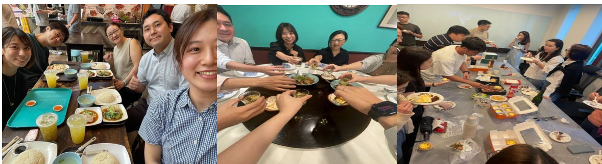
*image: lunch of first day and last day, and the birthday part

last days of my internship, and every second Friday of the month, they host a birthday party for those born that month. This provides a great opportunity for cross-departmental interaction and networking.