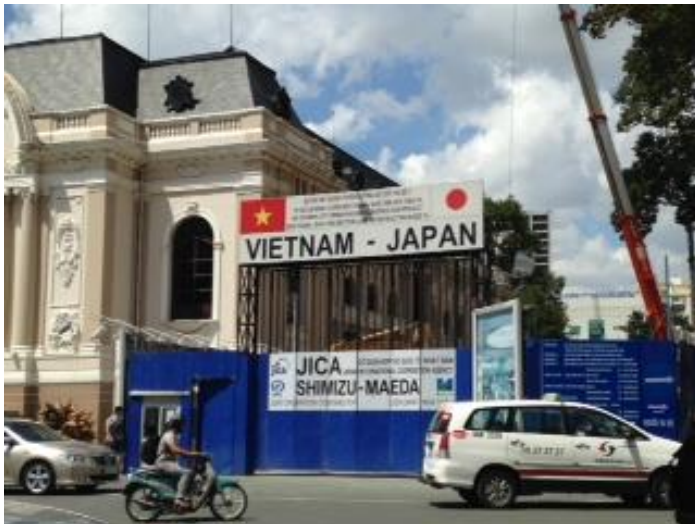
(Investment by Japanese Companies and JICA)