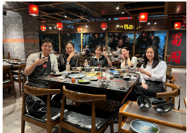
Eating out with JLPW members