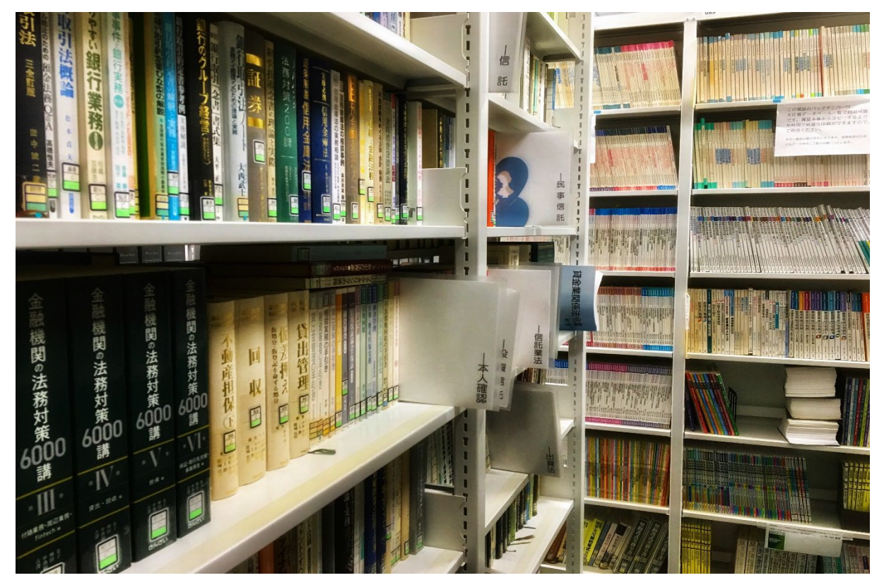
The law firm's library