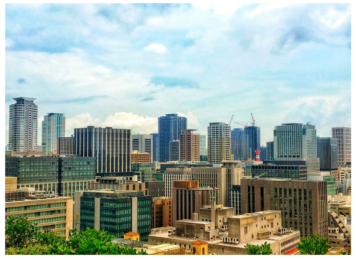
View from the observation deck of the building where the law firm is located