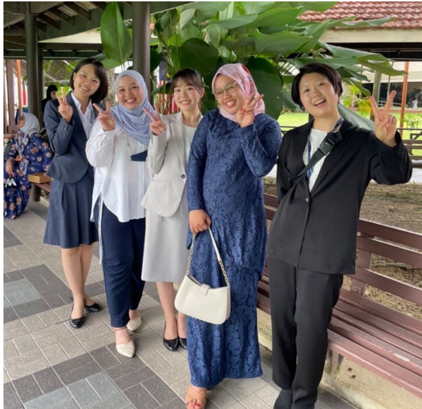
The Firm's party for Independence Day