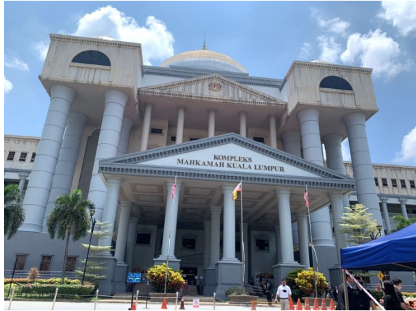
Kuala Lumpur Courts Complex